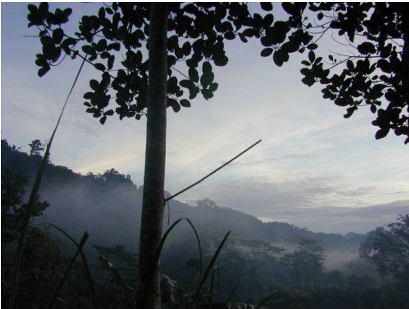
Mindanao, Philippines Morning Dawn May 1, 2016

“Call unto me, and I will answer thee, and show thee great and mighty things, which thou knowest not.” Jeremiah 33:3 (KJV)