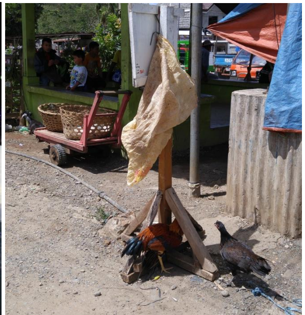
The Roosters and Hens off to Market